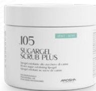
.105 SUGARGEL SCRUB PLUS Exfoliating lipogel with cane sugar