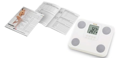
CLIENT DATA SHEET WHITE DIGITAL SCALE