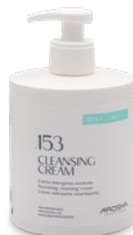
.153 CLEANSING CREAM Nourishing cleansing cream