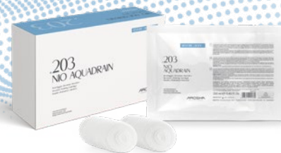
.203 NIO AQUADRAIN Intensive draining bandage