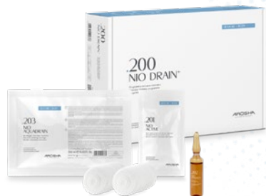
.200 NIO DRAIN+ Intensive draining programme

This is the second phase of the method, designed to rebalance, harmonize, and restore the skin's natural physiological conditions. On the face, the goal is to protect, strengthen, and enhance radiance; on the body, to promote the drainage of excess fluids and restore the physiological balance of the tissues.