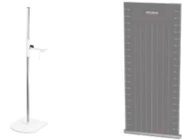
BODY MEASURE SYSTEM GRADUATED BACKGROUND

An important preparatory step, always performed before treatments. At Arosha Beauty Centers, clients are guided throughout the entire program with a personalized analysis and continuous progress monitoring to ensure their desired results are achieved.