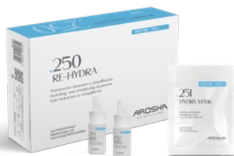
.250 RE-HYDRA Hydrating and rebalancing treatment