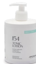
.154 TONIC LOTION Tonic lotion