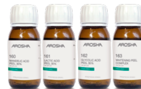
MANDELIC ACID 30% - LACTIC ACID 30% - GLYCOLIC ACID 35% - WHITENING PEEL COMPLEX

50ml - Cod ARO405003 - ARO405004 - ARO405002 - ARO405005