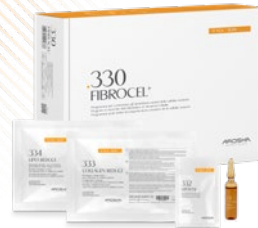
.330 FIBROCEL+ Program to treat fibrous and sclerotic cellulite