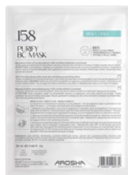
.158 PURIFY BC MASK Exfoliating and purifying mask made in 100% Pure Biocellulose Fibers