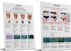
CELLULITE GRADING GUIDE ADIPOSIITY GRADING GUIDE

100x70 cm - Cod. ART001237 / Cod. ART001238