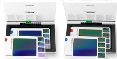
CELLULITE THERMOGRAPHY KIT ADIPOSIITY THERMOGRAPHY KIT