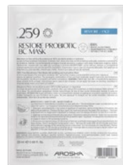
.259 RESTORE PROBIOTIC BC MASK Soothing and Restorative Mask in 100% Pure Biocellulose Fibres