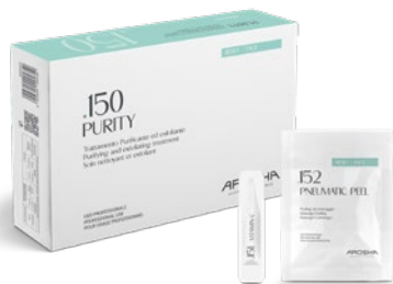
.150 PURITY Purifying and exfoliating treatment